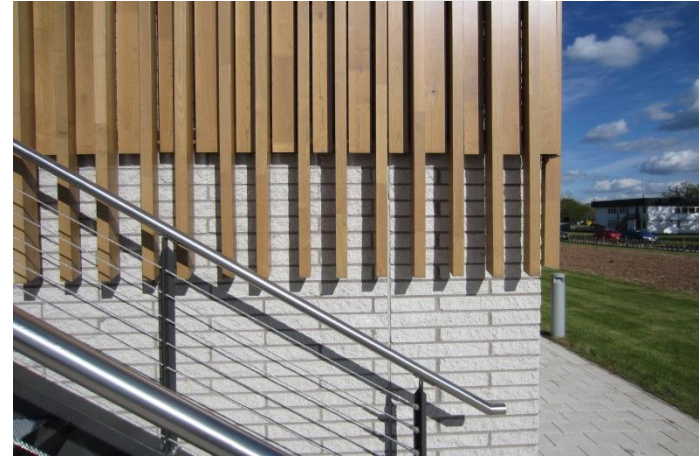
Locally sourced sustainable cladding