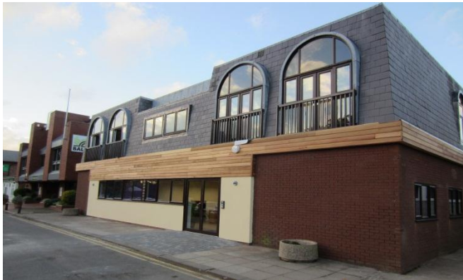
Unit 173 – let to Parkwood