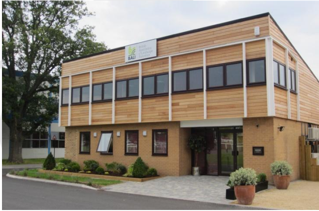
Unit 63 – let to BALI