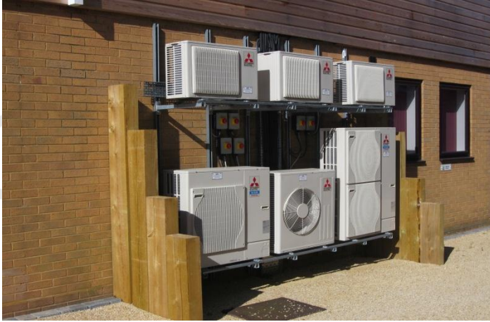
Air Source Heat Pump