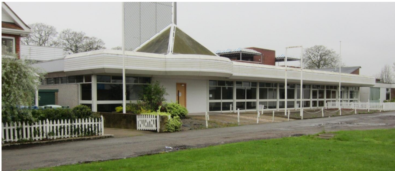
Unit 169 before work started