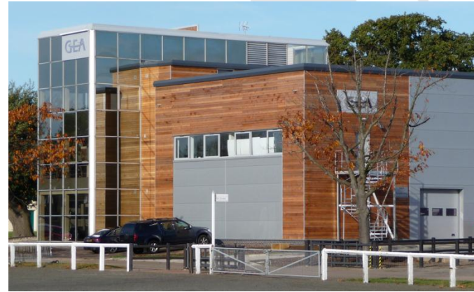
Unit 112 – let to GEA Farm Technologies